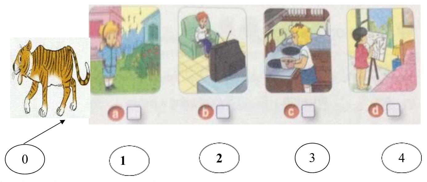
Ouestion 2: Listen and number (1 point)