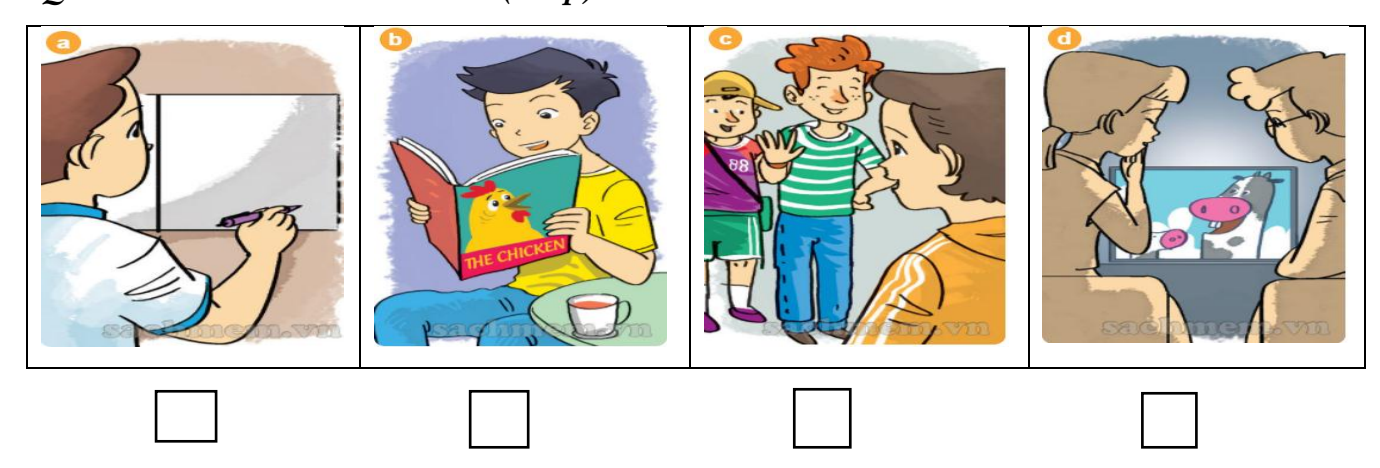
Question 2. Listen and tick. (1.0 p)